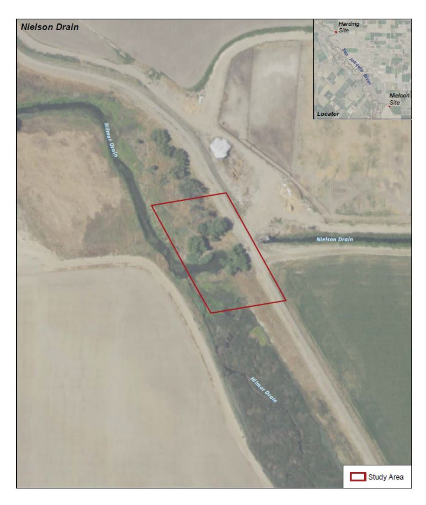
3) Project footprint map